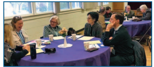
Synod Workshop held at St. John's on February 13 th